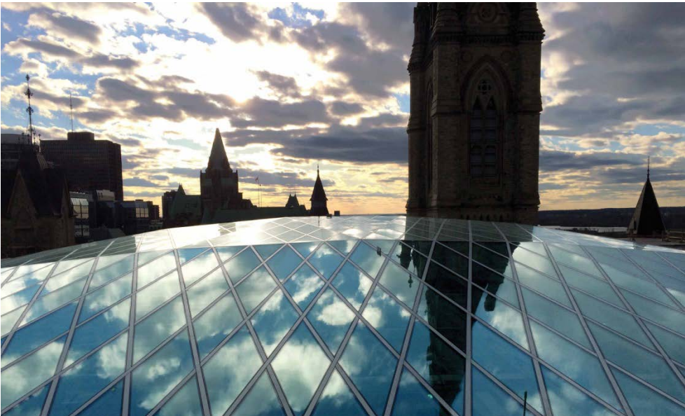
West Block rehabilitation project, Ottawa (curved glass roof).