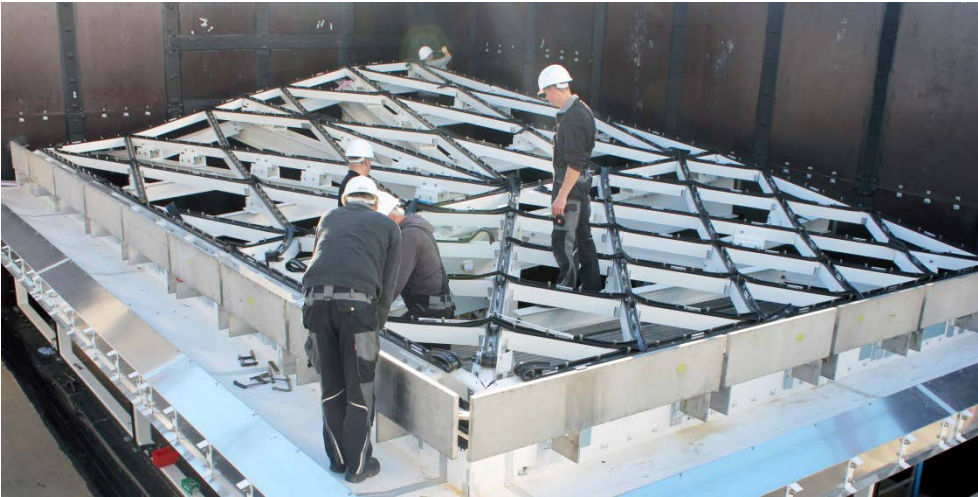
Mock-up for West Block rehabilitation project.