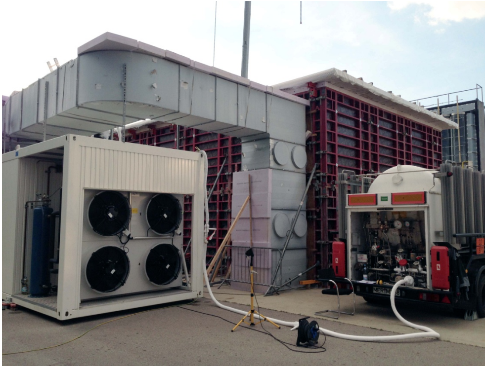
Test chamber with air-conditioning equipment and trailer with tank of liquid nitrogen (mock-up for Brookfield Place project).