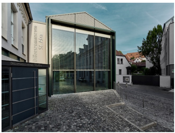
Caption: A total of three ISOshade® elements with heights of almost 7m form the ISOshade® façade of the St. Afra Diocesan Museum in Augsburg, Germany.