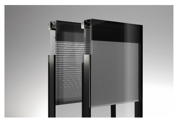
Caption: ISOshade<sup>®</sup> is an insulating glass unit with a factory integrated sun protection system (venetian blind or vertical blind).