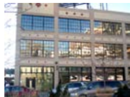
seele GmbH / 2007 – © seele