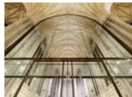
seele, Inc. / 2017 – © Stephan Wurster