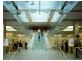
seele, Inc. / 2012