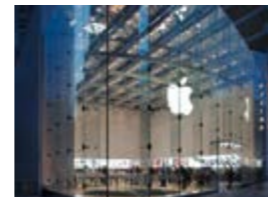
seele, Inc. / 2009 – © Andreas Keller