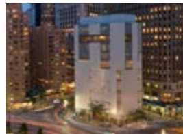
seele, Inc. / 2008 – © David Heald