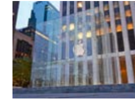
seele, Inc. / 2006, 2011, 2018 – © seele