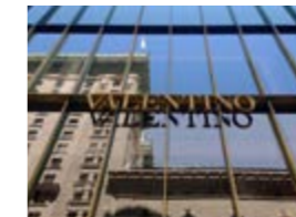
seele, Inc. / 2014 – © seele