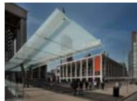
seele, Inc. / 2009 – © Andreas Keller