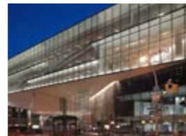
seele, Inc. / 2009 – © Andreas Keller