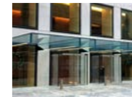
seele, Inc. / 2016 – © seele