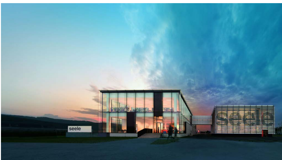
Location of se-austria in Schörfling/Austria. ©Matthias Reithmeier