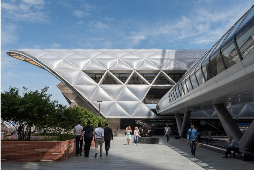
Canary Wharf Crossrail Station